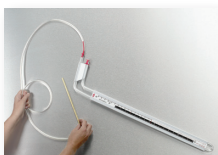
1227 Mounted in Incline Position