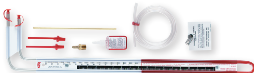
1227 Dual Range