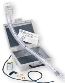
1212 Gas Pressure Kit